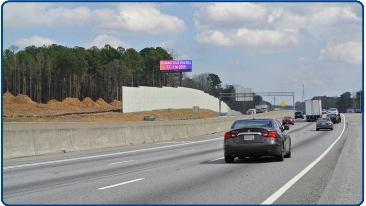
West side of I-85 north of Gravel Springs Rd Exit 118, Facing South for Northbound Traffic