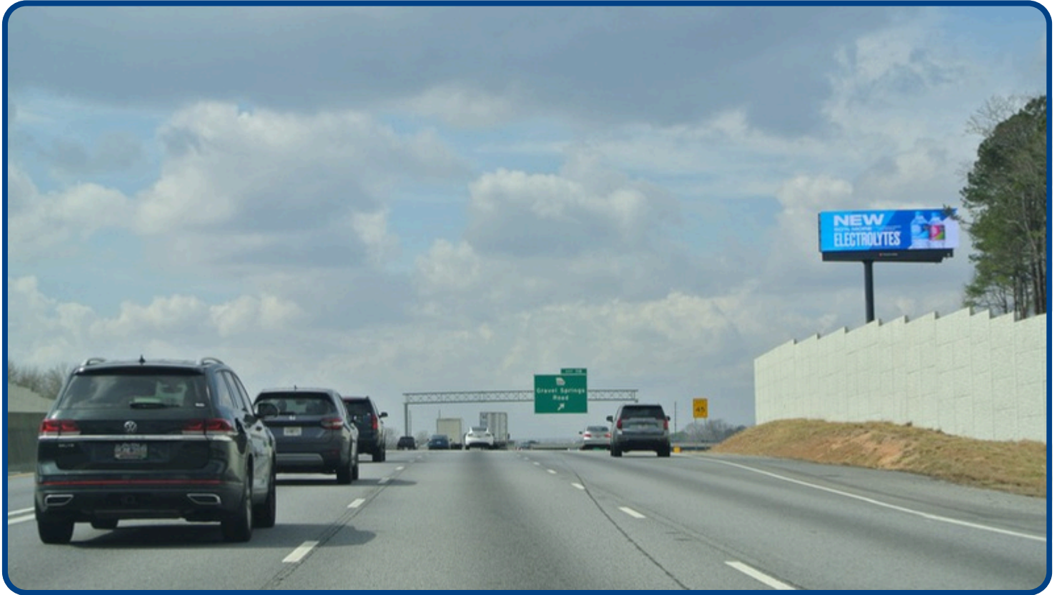
West side of I-85 north of Gravel Springs Rd Exit 118, Facing North for Southbound Traffic