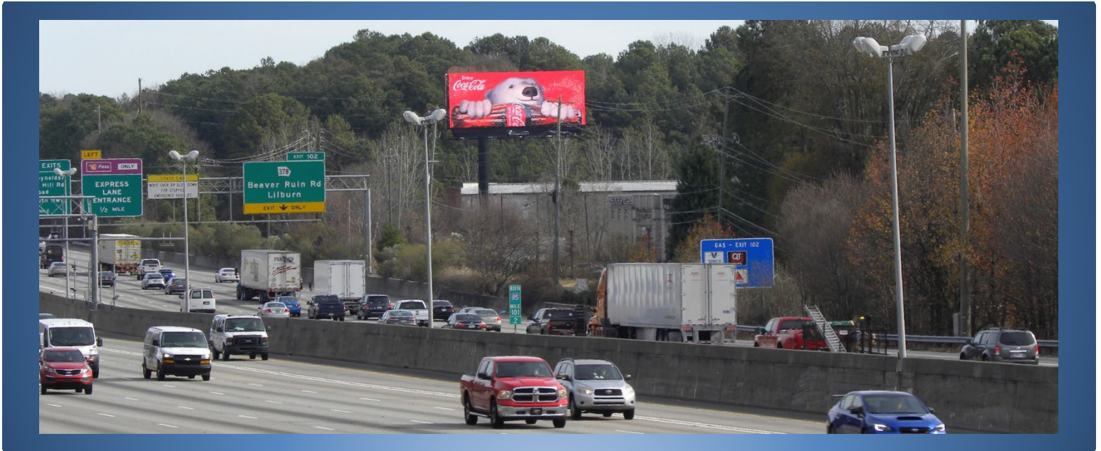
E/S I-85 S/O Exit 102 Beaver Ruin Rd F/S for Northbound traffic.