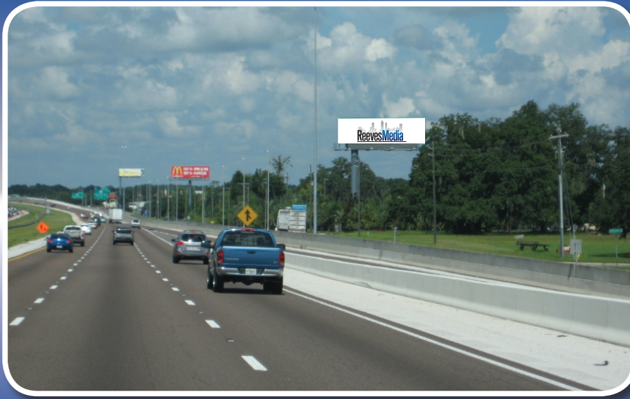
NORTH SIDE OF I-4, 1/2 MILE EAST OF HWY 39, FACING EAST FOR WESTBOUND TRAFFIC. RIGHT HAND READ GOING INTO TAMPA, ST PETE/ CLEARWATER, FL